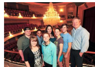
Students and professor who attended the American College Theatre Festival