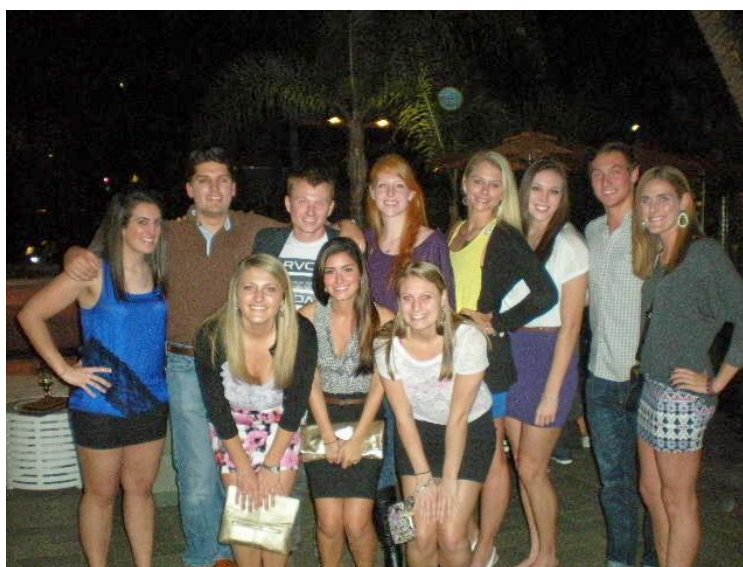
Students attend a psychology conference in San Diego California from January 26-28

competencies, foster critical and creative thinking, and provide students with privileged opportunities to add to the sum of human knowledge.